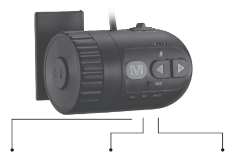
Playback indicator Video recording indicator Audio recording indicator (green) (red) (yellow)

1. The camera has three small coloured LEDs positioned at the rear of the camera.